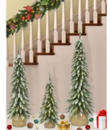
Member's Mark Pre-Lit Set of 3