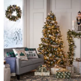
Member's Mark 7.5' Color