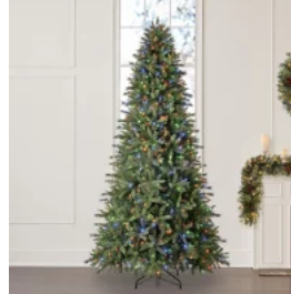
Member's Mark 9' Grand Spruce