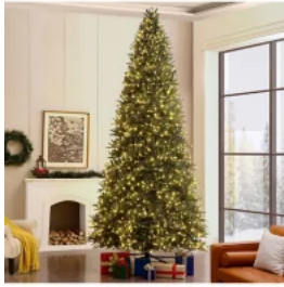
Member's Mark 12' Bristle Fir