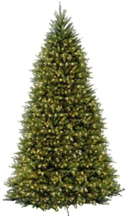
Hover Image to Zoom