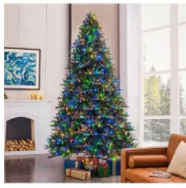
Member's Mark 9' Bristle Fir